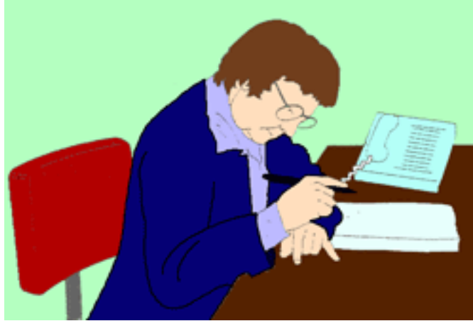
Stage 1 Figure 1

At any age, persons may potentially be free of objective or subjective symptoms of cognition and functional decline and also free of associated behavioral and mood changes. We call these mentally healthy persons at any age, stage 1, or normal.