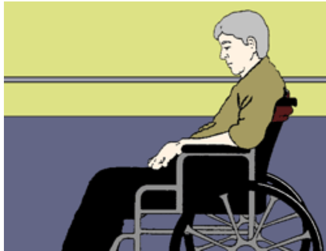
Stage 7d Figure 12

unless there are armrests to hold the patient up in the chair (Figure 12).