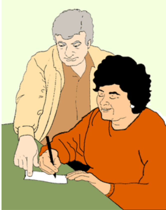
Stage 4 Figure 4

Symptoms of impairment become evident in this stage. For example, seemingly major recent events, such as a recent holiday or a recent visit to a relative, may, or may not, be recalled. Similarly, obvious mistakes in remembering the day of the week, month or season of the year may occur. Patients at this stage can still generally recall their correct current address. They can also usually correctly remember the weather conditions outside and significant current events, such as the name of a