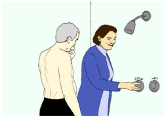
Stage 6b Figure 7

in dressing independently occur. In this 6b substage, patients generally develop deficits in other modalities of daily hygiene such as properly brushing their teeth independently.