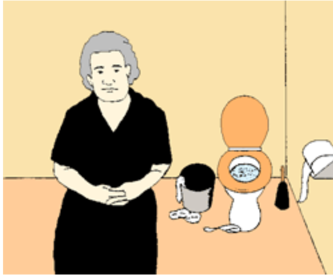
Stage 6c Figure 8

Requires assistance with cleanliness in toileting (Figure 8). After Alzheimer's patients lose the ability to dress and bathe without assistance, they lose the ability to independently maintain cleanliness in toileting.