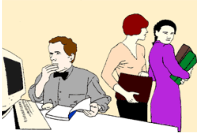
Stage 3 Figure 3

Other MCI subjects may manifest concentration deficits. Many persons with these symptoms begin to experience anxiety, which may be overtly evident.