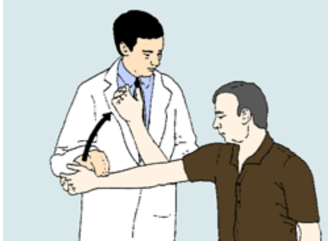
Stage 7 Figure 13

In the final stages of AD patients manifest increasing rigidity. Rigidity is evident to the examiner in the stage 7 patient upon a passive range of motion of major joints such as the elbow.