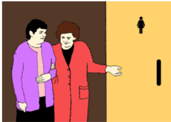
Stages 6d Figure 9

In this sixth stage cognitive deficits are generally so severe that persons will display little or no knowledge when queried regarding such major aspects of their current life circumstances as their current address or the weather conditions of the day.