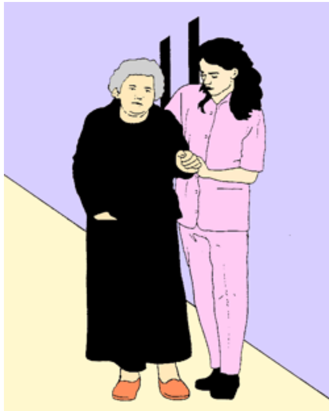
Stage 7 Figure 11

and the patient requires assistance in walking (Figure 11). Each substage of this final seventh stage lasts an average of 1-1.5 years.