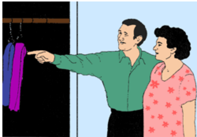
Stage 5 Figure 5

In this stage, deficits are of sufficient magnitude as to prevent catastrophe-free, independent community survival. The characteristic functional change in this stage is early deficits in basic activities of daily life. This is manifest in a decrement in the ability to choose proper clothing to wear for the weather conditions and or for the everyday circumstances (occasions). Some patients begin to wear the same clothing day after day