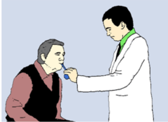
Stage 7 Figure 15

Sucking reflex (Figure 15). ‘Primitive’ reflexes, also known as ‘infantile’ reflexes or ‘developmental’ reflexes, such as the sucking reflex, are evident in stage 7 of people with Alzheimer’s.